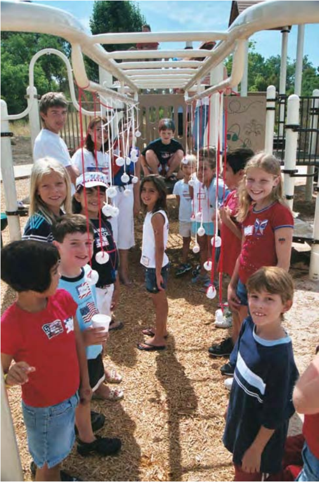
The Graystone Gang