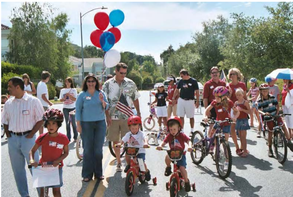
Center: The Parade