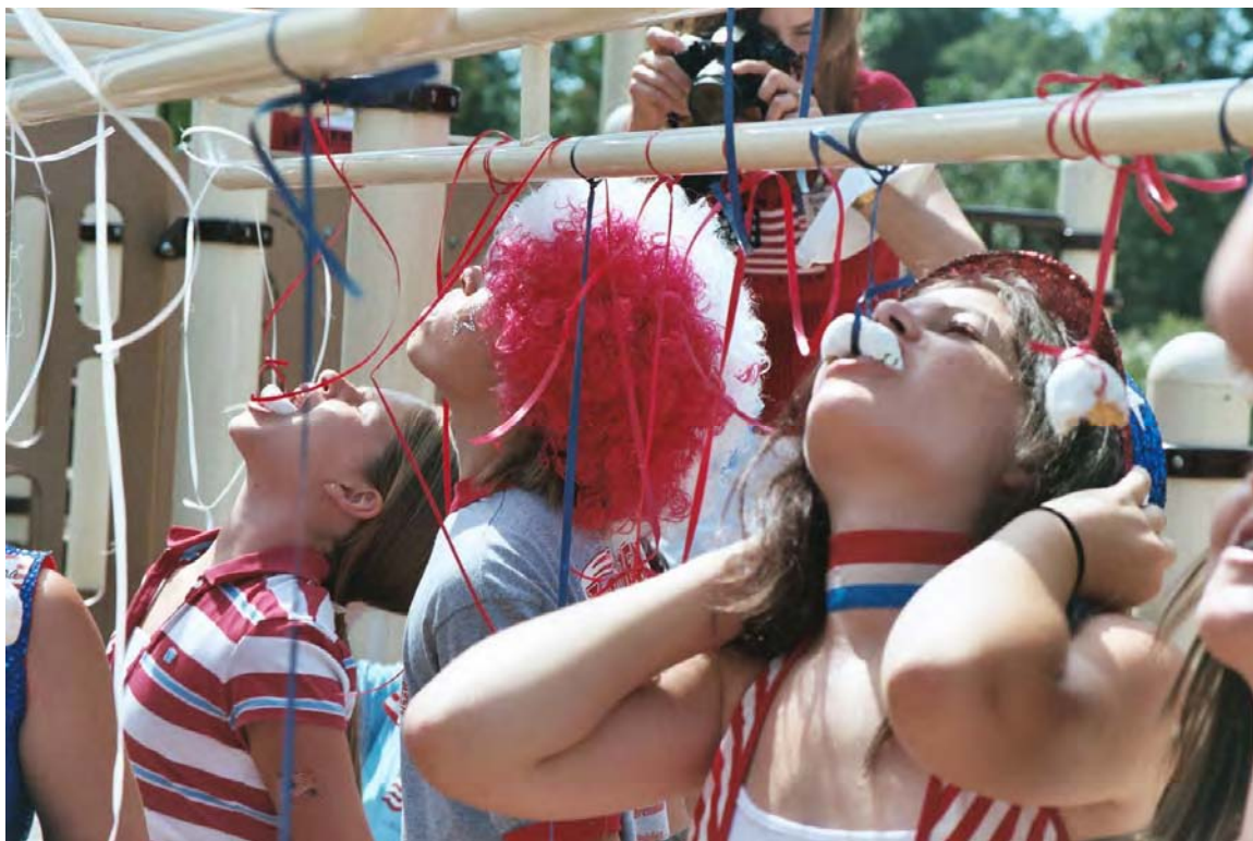
The Donut Game