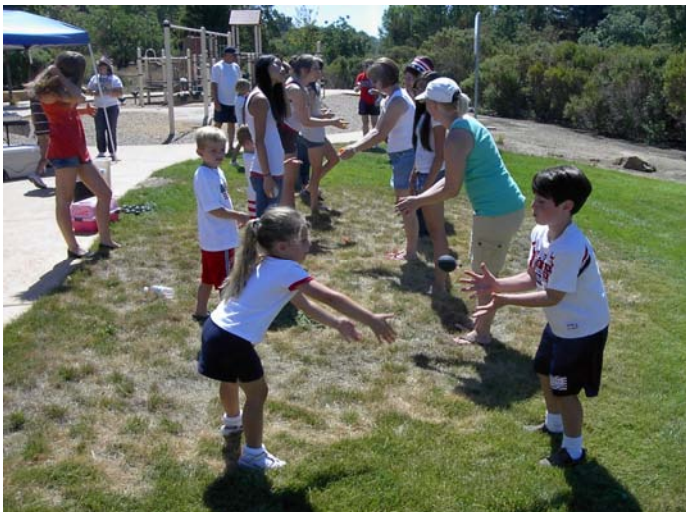
The kids (and adults alike) always enjoy the balloon toss